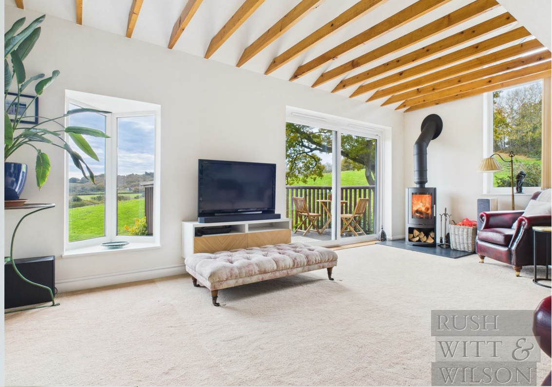
RUSH WITT & WILSON